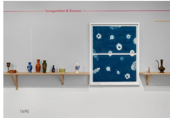
Installation views of Terrestrial Bodies .

Where the souvenir trades in surface and portability, Valdés’s five cyanotypes turn to mapping—revealing it as a form that can unmoor as easily as it can locate. They create spatial ruptures within the installation, interrupting its geographic and chronological flow with their positioning. Two in particular— Last Voyage , placed on the floor, and Celestial N. 34 , inset into an otherwise continuous shelf—evoke astral charts, etched with faint lines and scattered coordinates. Emptied of legible markers or territorial names, they withhold the cues for orientation. Cartography has long been a means of charting relations, but also of fixing borders, displacing Indigenous epistemologies, and legitimizing imperial claims. Valdés suspends those functions: stripped of its bearings, the map reveals not territory but ideology, giving way to the instability of representational frames. 8