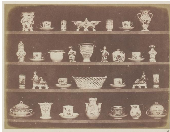
Left: Anna Atkins, Cyanotypes of British and Foreign Ferns , (1853). Cyanotype, 25.4 × 19.4 centimeters. The J. Paul Getty Museum. Right: William Henry Fox Talbot, Articles of China , (before January 1844). The Metropolitan Museum of Art.