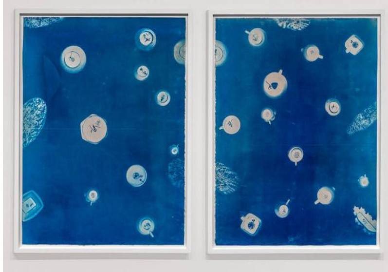
Juana Valdés, Under View of the World , (2015). Cyanotype diptych, 30 × 41 inches each (unframed).

Carrying this tension between what can be seen and what remains obscured, the cyanotypes Under View of the World (2015) depict the undersides of ceramic and clay vessels, their rounded bases and concave ridges rendered in negative against deep Prussian blue. Valdés likens them to the vessels of trade and the ships that carried enslaved and displaced people across oceans—seen as if from beneath the water, looking up at drifting hulls. The works recall nineteenth-century botanical photography, particularly that of Anna Atkins, who used cyanotypes to catalog