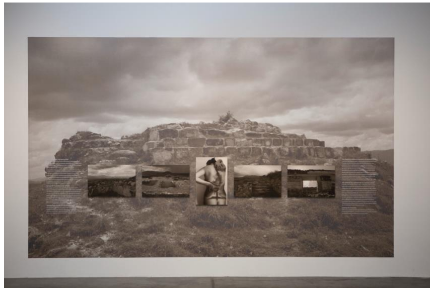
Fig. 1 Christina Fernandez, Bend , 1998/2020, one photographic/text wall mural and 5 pigment prints mounted on Dibond aluminum, mural dimensions up to 11 ft. 6 in. × 19 ft., prints 20 × 30 in.

In a video interview Los Angeles-based artist Christina Fernandez describes Bend , which the artist has now substantively re-created several times (1998, 2014, 2020), as one of three works she produced after her 1990s travel to Oaxaca, Mexico. 1 In this essay I focus on Bend's post-2020 version, which consists of a photographic and text wall mural (variable dimensions up to 11 ft. 6 in. × 19 ft.) and five pigment prints (each 20 × 30 in.), four of which also comprise the series Ruin . 2 The mural