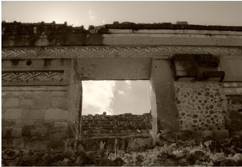
Fig. 2. Christina Fernandez, Mitla , 1998, from the series Ruin , sepia-toned gelatin silver print, 20 x 30 inches, edition of 4. Courtesy of the artist.

Fernandez autocorrects, “What I thought was a representation of Cocijo is instead a representation of the dead interned in tomb 104 as Cocijo; transformed, taking on Cocijo’s attributes, into the people of the clouds.”